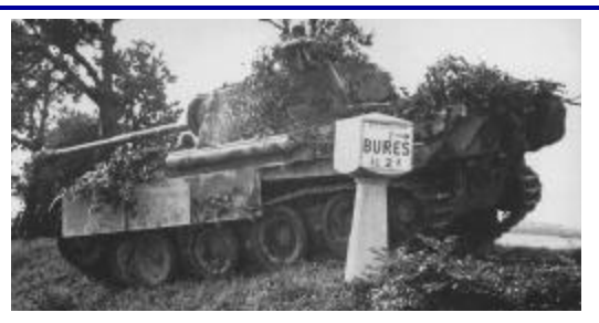
Panther preparing for a counterattack.

SITUATION: The final assault across the River Oder is now in full swing. Despite severe losses on the first two days the Soviets are now poised to break through the Seelowe Heights defenses and move towards Berlin. Two entire Soviet tank armies have finally succeeded in smashing through the plateau and now are moving quickly to exploit their success.