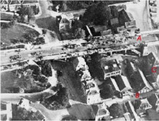
Picture of the bridge shortly after the first attempt by SS recon forces to take it. The large number of burnt out vehicles and wreckage can clearly be seen.

someone will be able to find some of the unused film and put out the definitive version. It would make a good film even better.