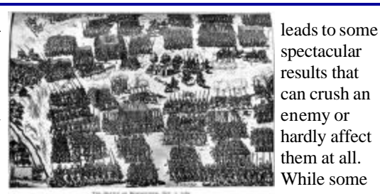
Late Renaissance era battle with massive pike blocks in the center.

may not like the random nature of the results, it does tie into many of the battles I have read where strange things seemed to be consistent on Renaissance battlefields. Also, don't count on artillery to win battles for you. It is there for nuisance purposes and can force morale checks.