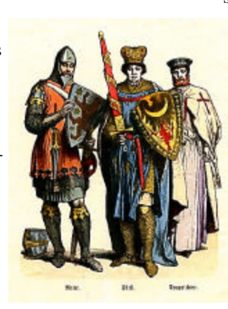
Early knights from one of the many religious orders.

The most fascinating feature of the rules is that each player rolls up their commander before the battle. Individual leaders all have their own chara cteristics which influence how they will act on the battlefield. As the battle rages on, these