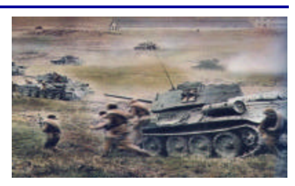
One of the few known color photos of T-34's attacking German positions with infantry support.

The two German companies [5,6] get mauled reaching the village, but succeed in securing the northern outskirts. The IS-2's arrive and begin slugging out with the Tiger and German heavy weapons holding the northern forests. But it is too little and too late. The last Soviet infantry force [B] tries to assault the village but is thrown back by a three sided crossfire. The Soviets fall back, leaving the Germans in possession of the village.